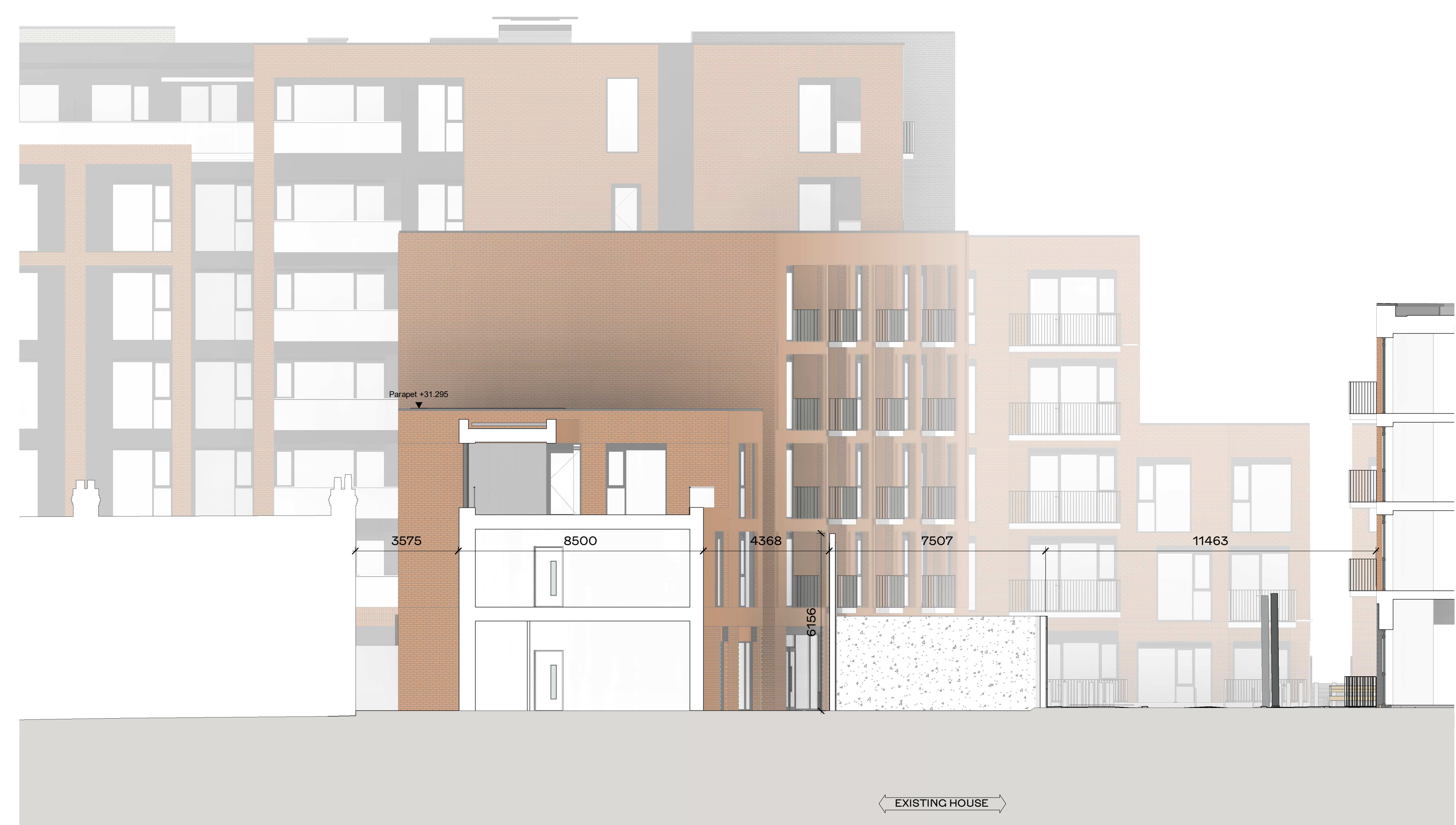
4 1 100 Section - Boundary Condition 01_C 1 : 100