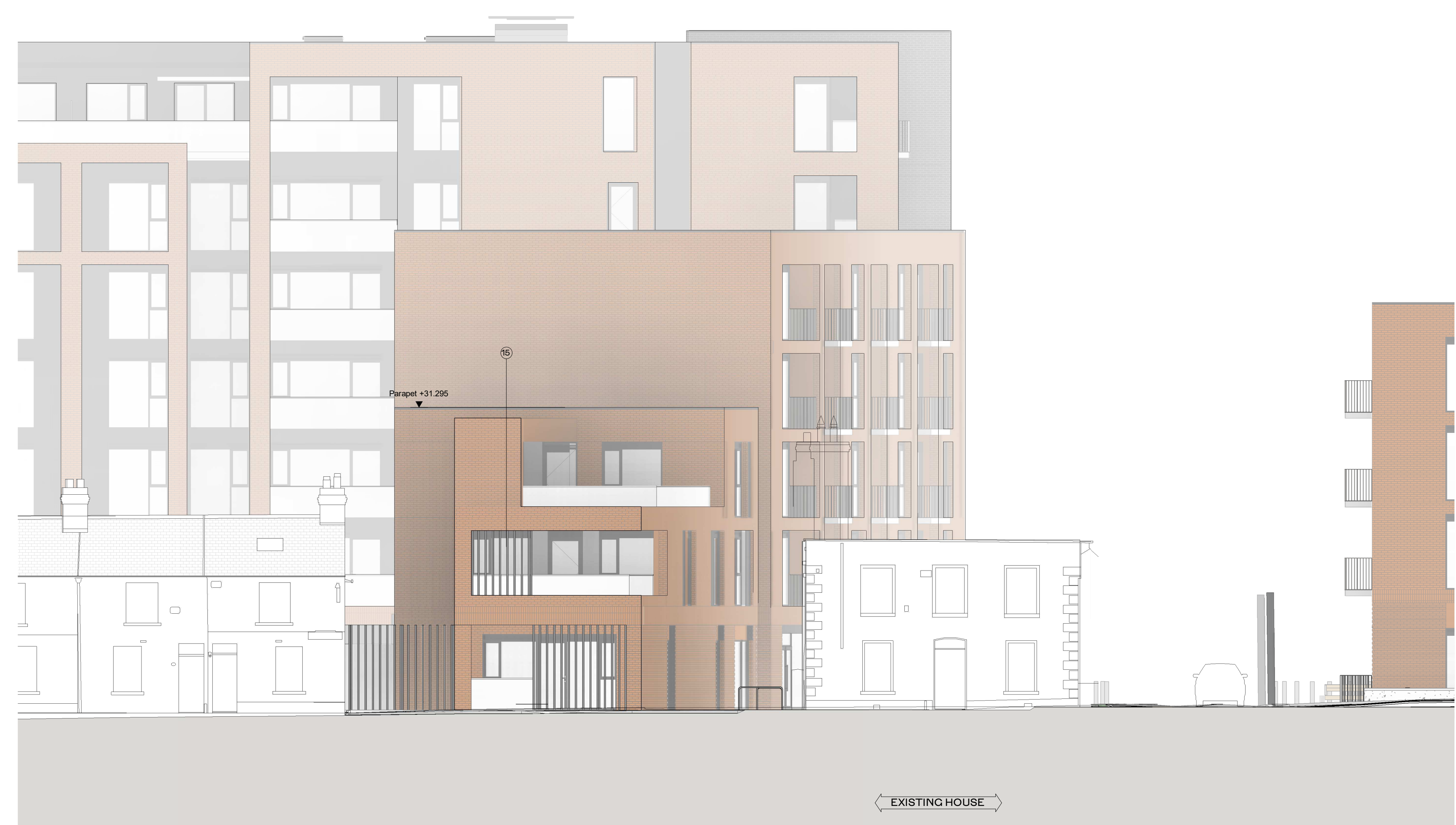
2 1 100 Section - Boundary Condition 01_A 1 : 100