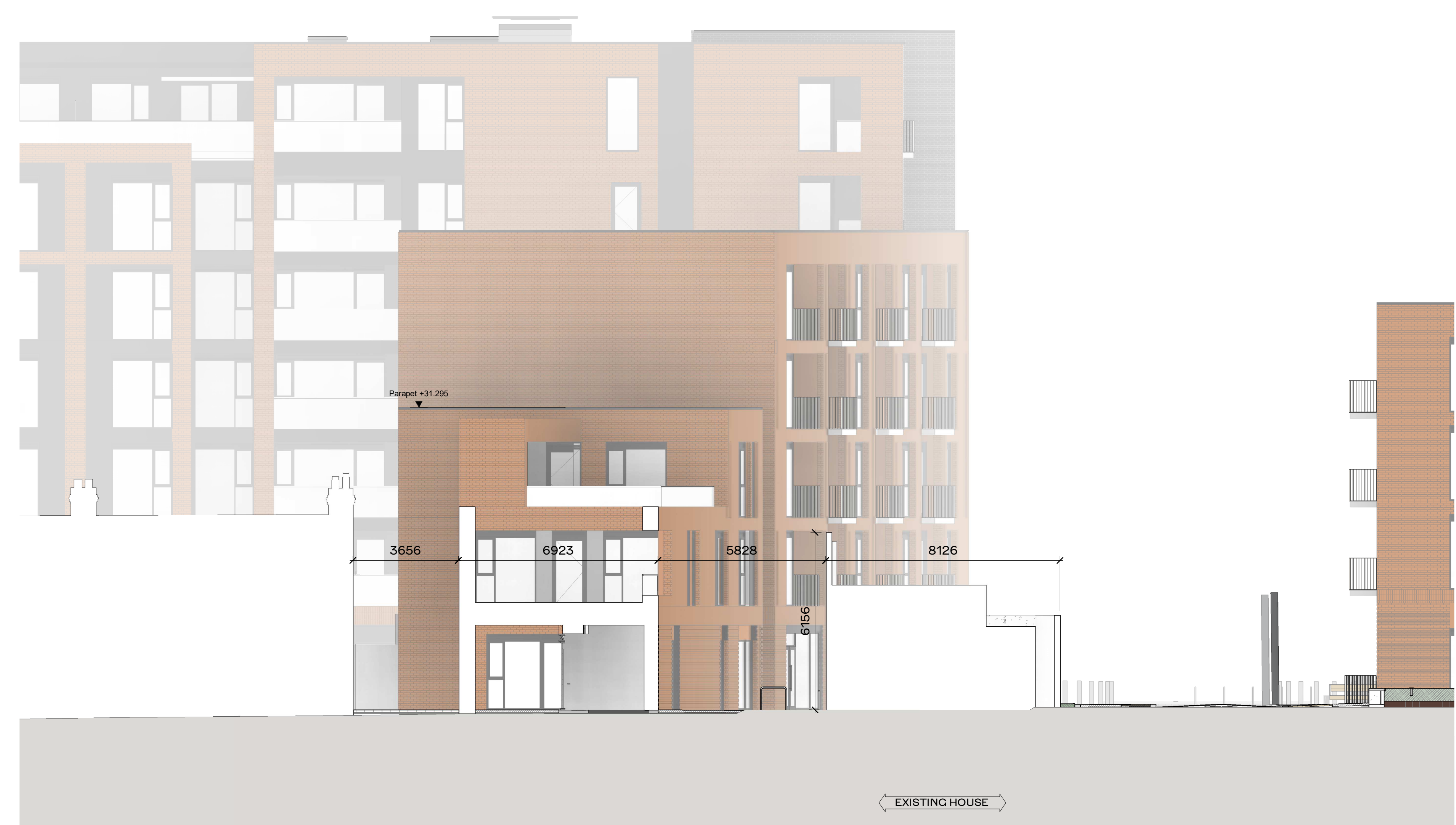
3 1 100 Section - Boundary Condition 01_B 1 : 100